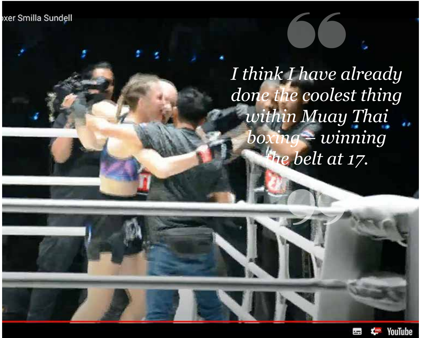
Boxer Smilla Sundell