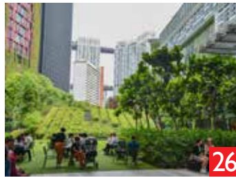
An exchange student in Singapore