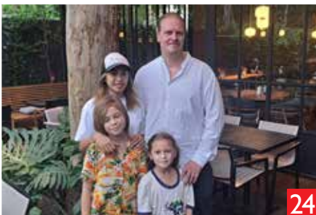
Take Eat Easy in Soi Yenakat 19