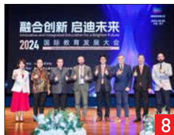
Harrow International School