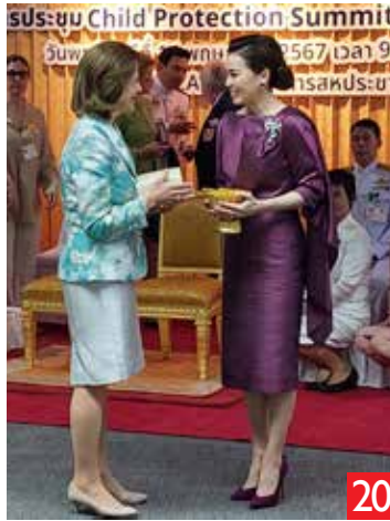
Queens of Sweden and Thailand in Child Protection Summit