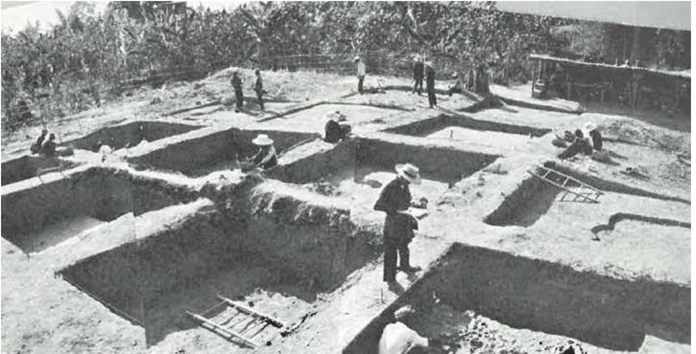
Excavation at the Bang Site, Ban Kao. The Bang Site was named after the owner of the land plot. Photo: Per Sørensen, in Per Sørensen & Tove Hatting: The Thai-Danish Prehistoric Expedition 1960-62. Archaeological excavations in Thailand, Volume II, Ban-Kao. Munksgaard, 1967.