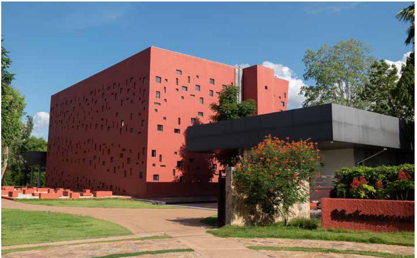
The Ban Kao Museum, a half hour drive from Kanchanabury.