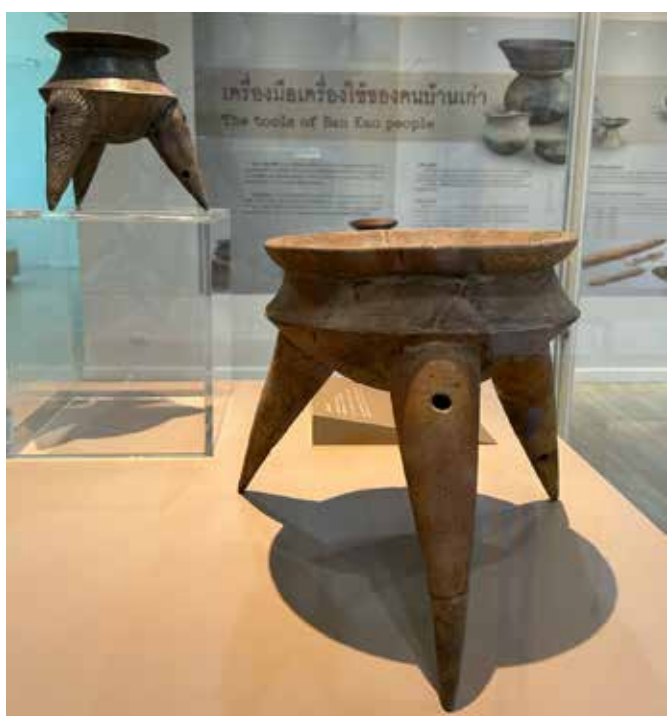
Tripod pottery made by the Ban Kao Culture 4,000-3,000 years BP.

Today, DNA research shows that with the complexity of countless peoples in Southeast Asia, the earlier models are too simplistic: both are correct, but each represents only part of the larger puzzle.