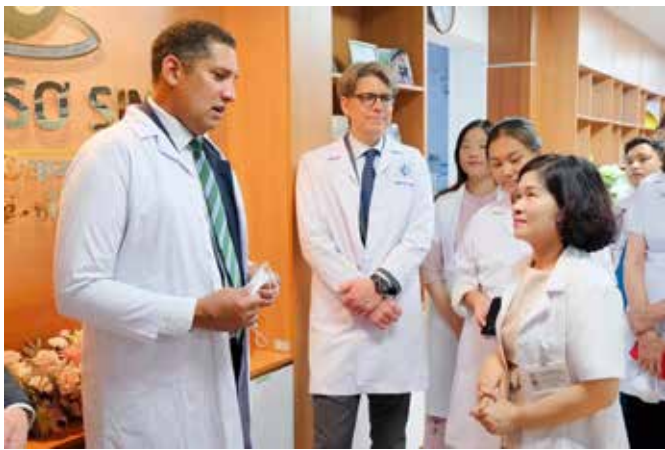
The Ambassador visited the National Hospital of Pediatrics—formerly Olof Palme Children’s Hospital in Hanoi—a symbol of Sweden’s long-standing support to Vietnam.

Smart healthcare is a perfect example of such bilateral collaborations, where Vietnam needs to improve its public health standards.