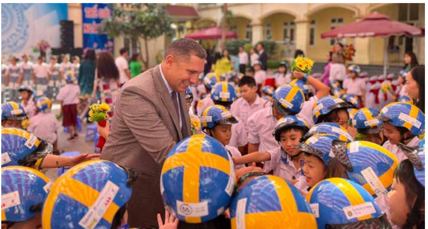
Traffic safety campaign carried out by the Embassy and Cau Giay District at Nam Trung Yen Primary School, November 2024.

“When you visit these, the work they do is very impressive. Hestra continues to champion craftsmanship and sustainability, embodying Swedish values of quality and environmental responsibility!”