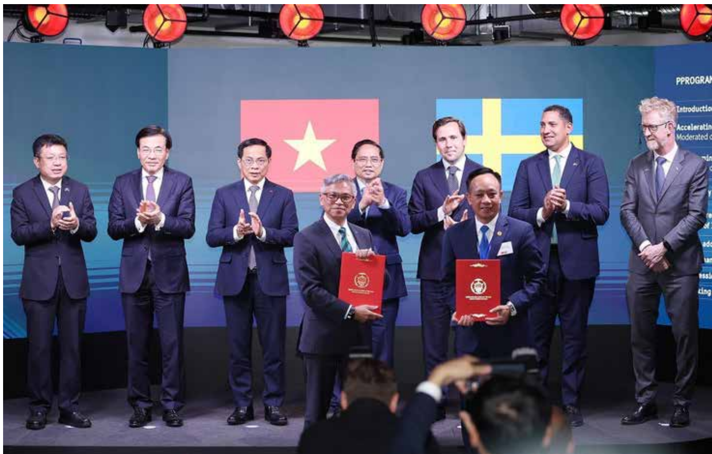
During the official visit of Prime Minister Pham Minh Chinh to Sweden in June 2025, numerous business agreements were reached between the two countries, notably a sectoral strategic partnership in science, technology and innovation, and green transition.

Ensuring their attractiveness as employers is also a common denominator noted by the ambassador: "For all of these companies, it's great to see both the Swedish and Nordic way of working, with a mindset of taking care of your staff. When you talk to management here, they understand that there is also competition, not least for skilled manpower."